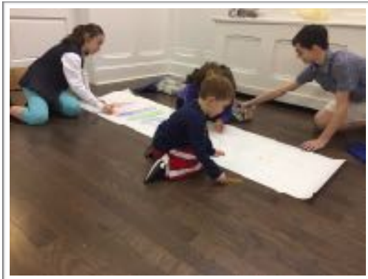
Children decorated the Alleluia Banner during the Shrove Tuesday Pancake Supper on Feb. 28th. This banner was "buried" in the church, and it will be hung in Parish Hall on Easter Sunday.