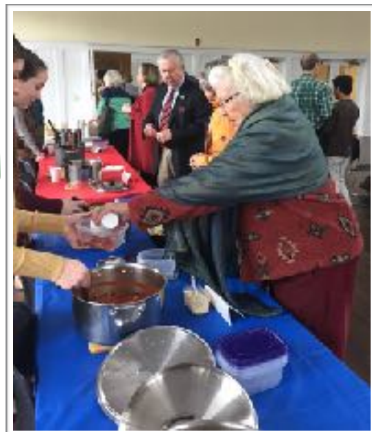
Scene from Souper Bowl Sunday, February 5, 2017