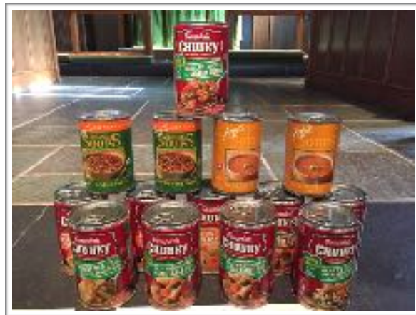
A few of the soup cans collected during Souper Bowl Sunday, February 5. All proceeds from the Souper Bowl went to the Food Bank Network of Somerset County.

We held a successful soup tasting fund-raiser at coffee hour on Feb. 5 th . There were six different soups to taste and purchase. On Tuesday, Feb. 28 th families enjoyed pancakes and sausages at the annual Shrove Tuesday pancake supper. All proceeds from both events will be donated to the Food Bank Network of Somerset County.