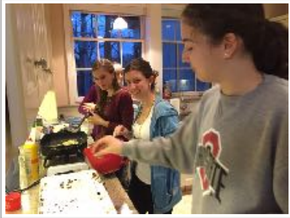
Girls prepare pancakes and sausages for the SJOTM Annual Pancake Supper. A big thank you to our parish youth for a successful event!